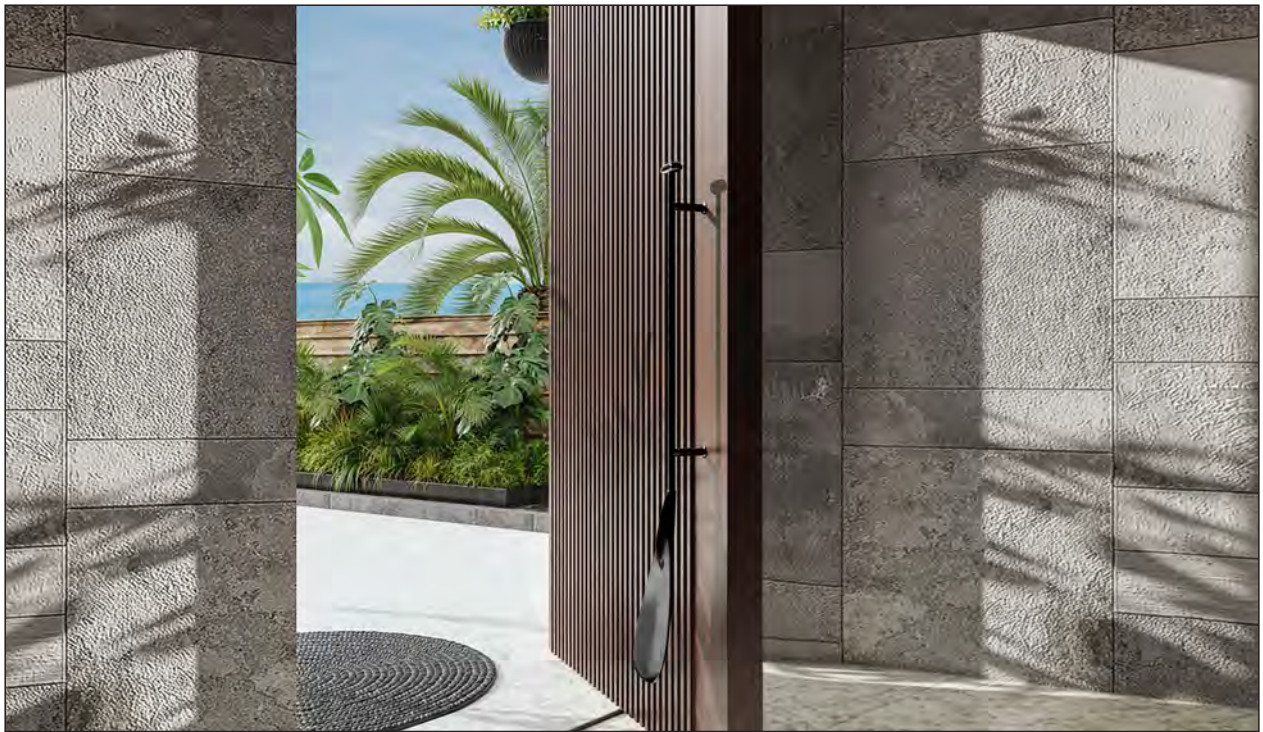
Matte Black (Finish ID:19)