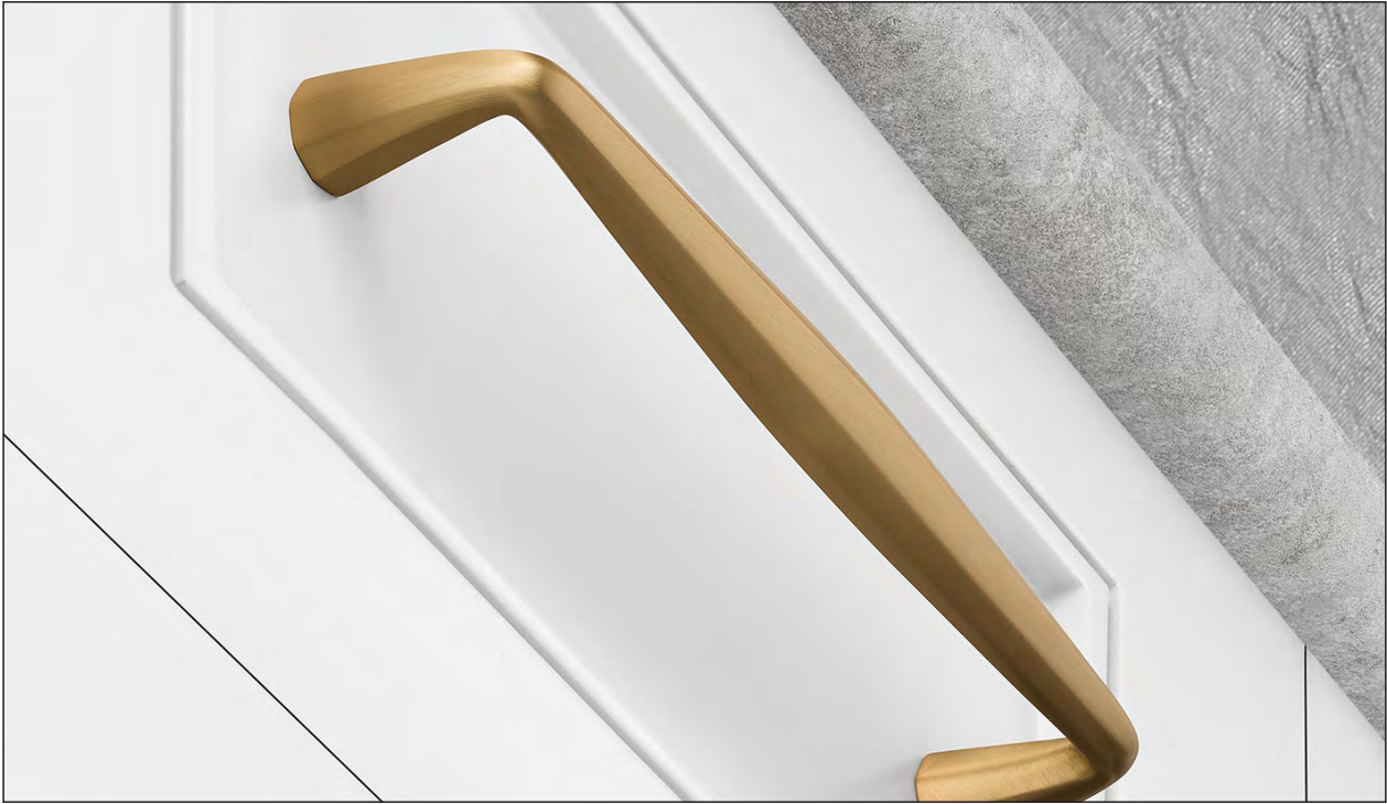
Satin Brass (Finish ID : 13)