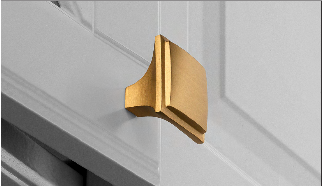
Satin Brass (Finish ID : 13)