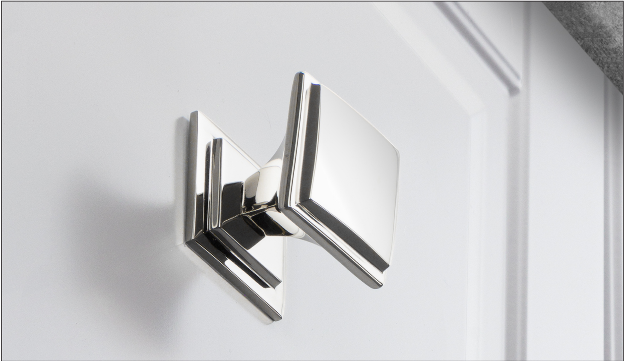
Polished Nickel (Finish ID:8)