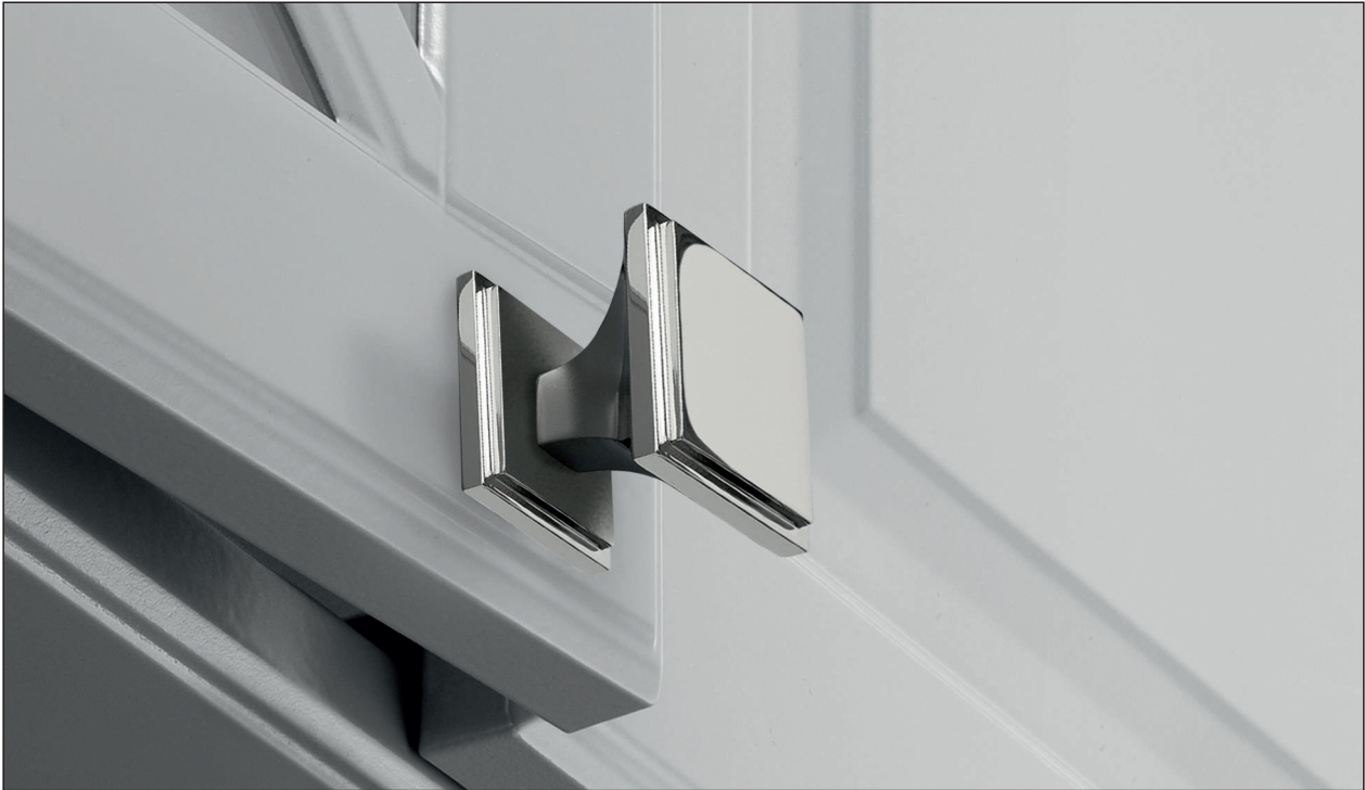
Polished Nickel (Finish ID : 8)