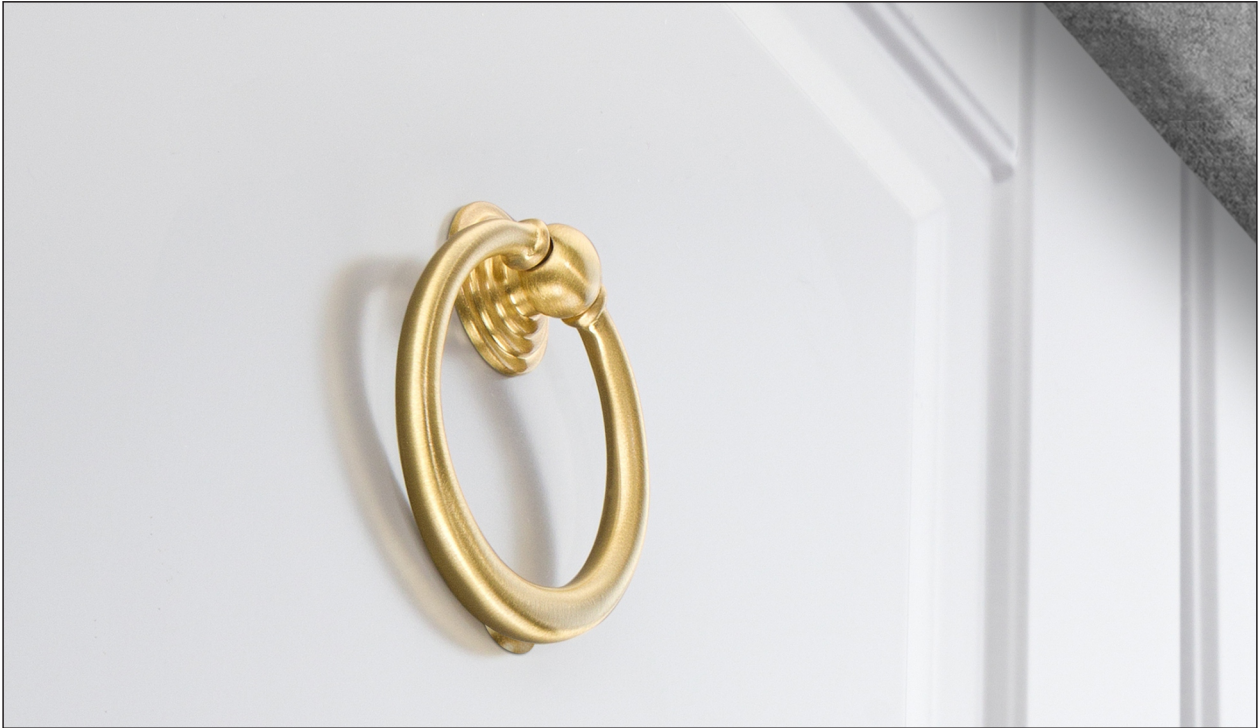
Satin Brass (Finish ID:13)