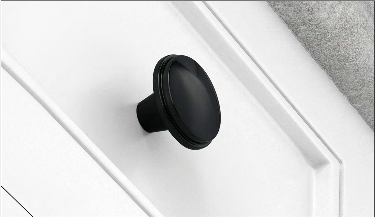
Matte Black (Finish ID:19)