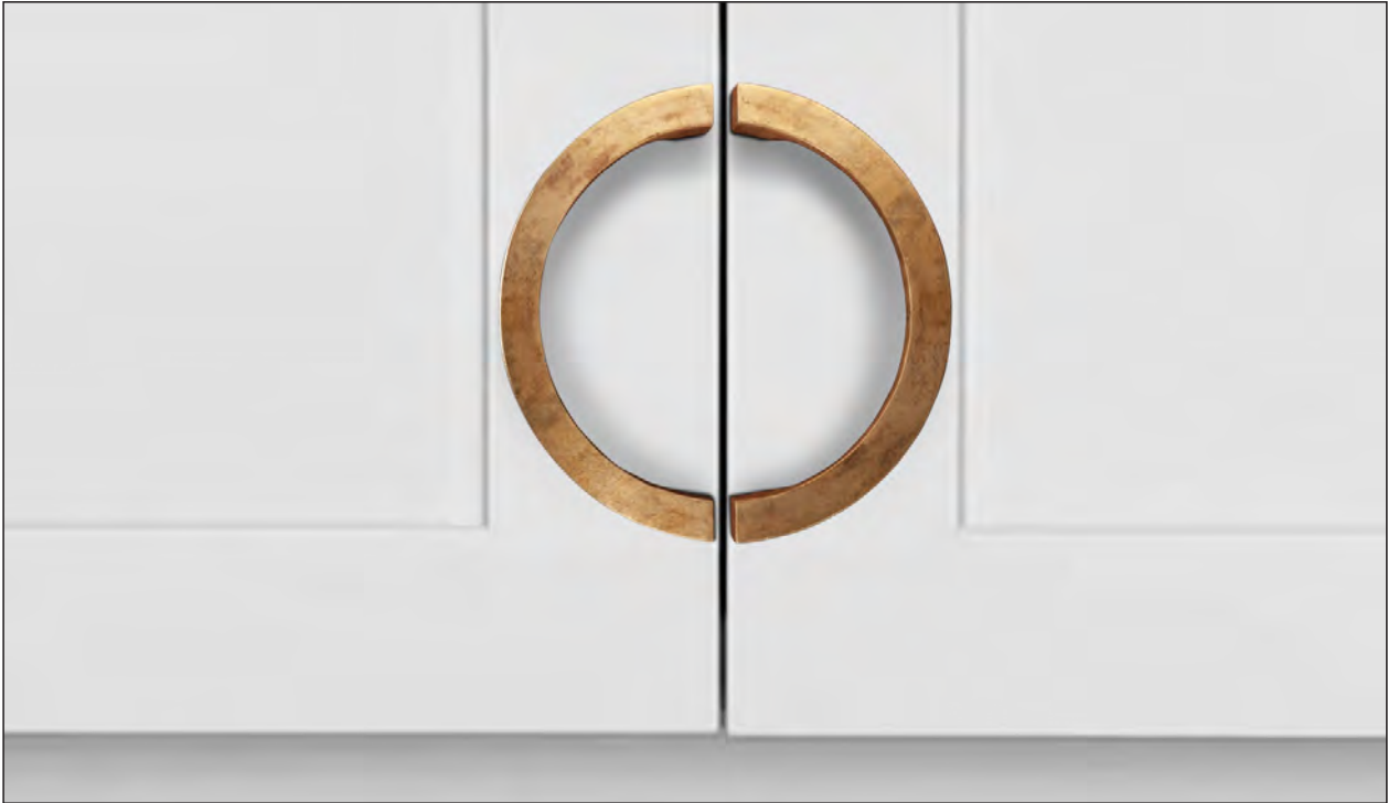
Silicon Bronze Light (Finish ID:53)