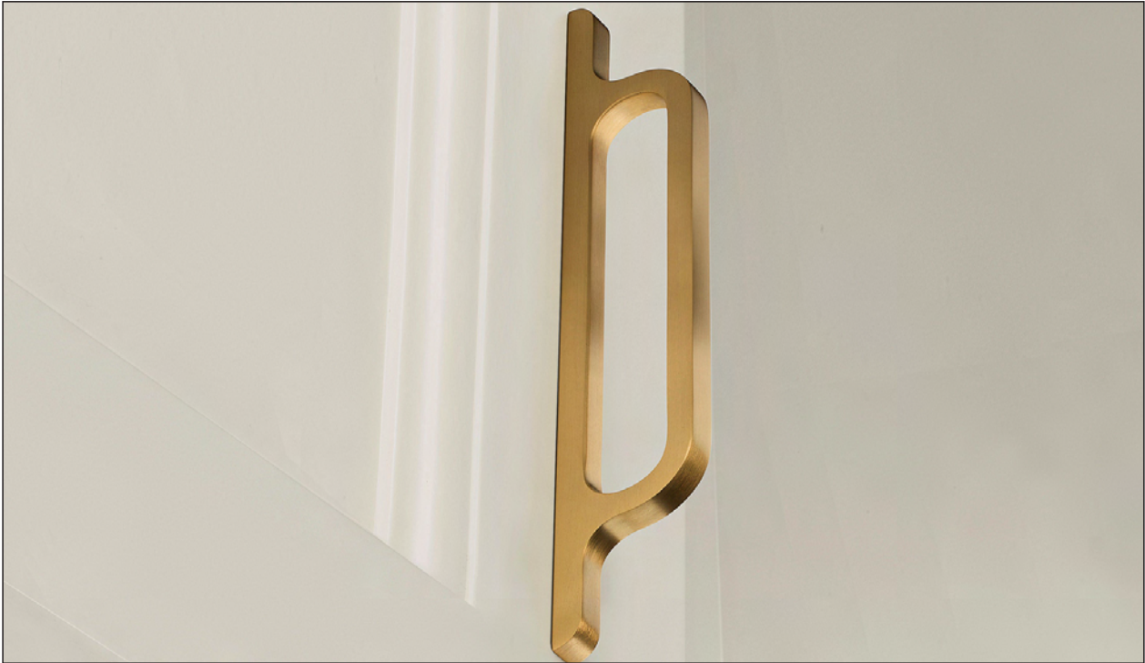
Satin Brass (Finish ID : 13)