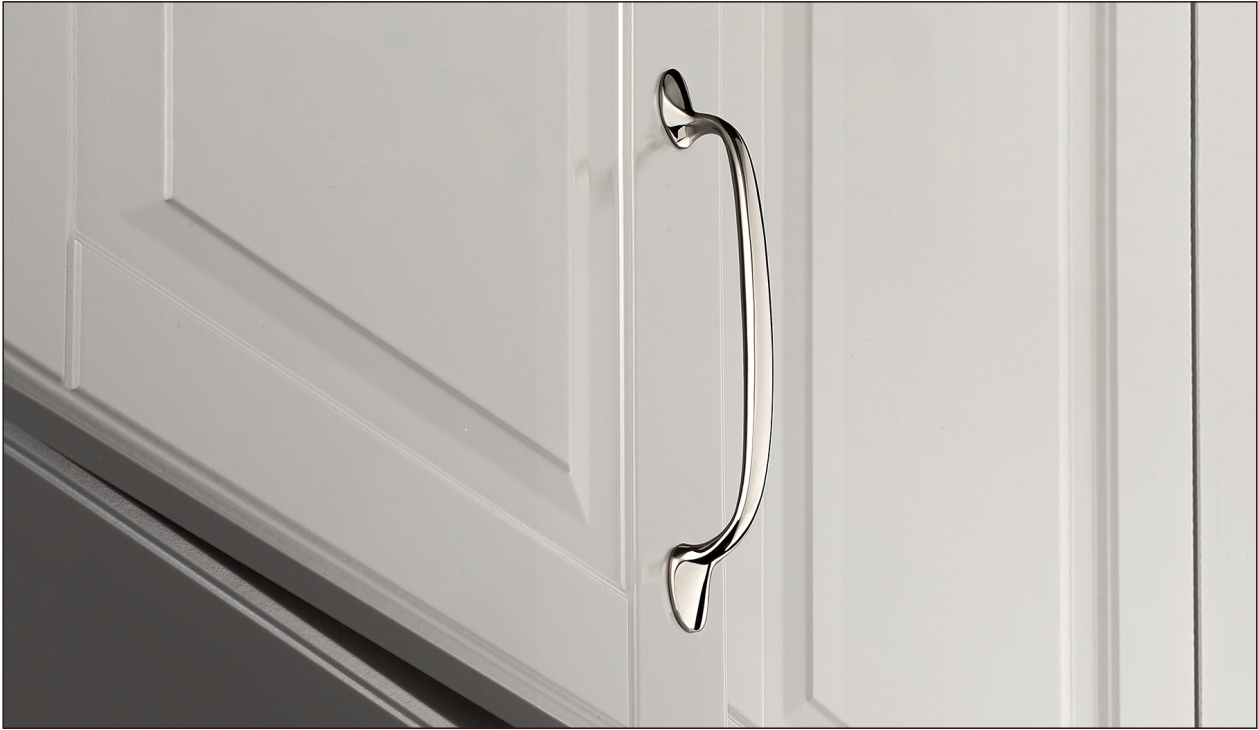
Polished Nickel (Finish ID : 8)