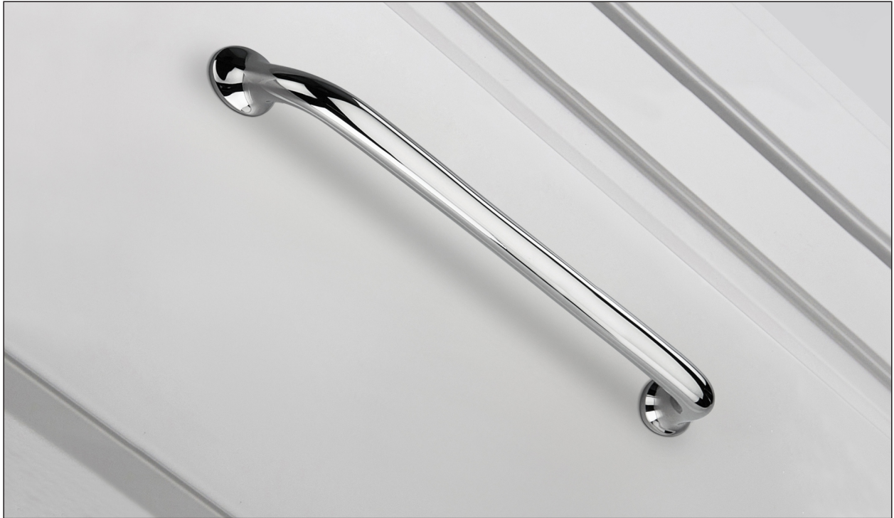
Bright Chrome (Finish ID:2)