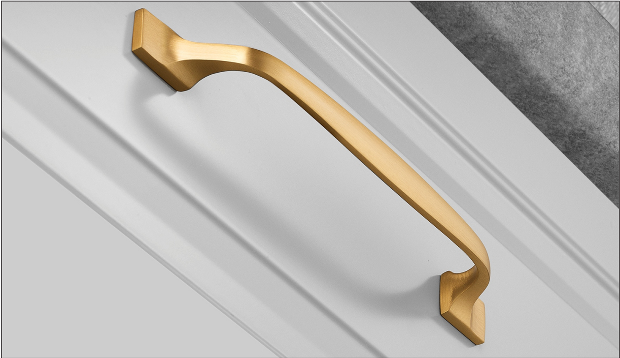
Satin Brass (Finish ID : 13)