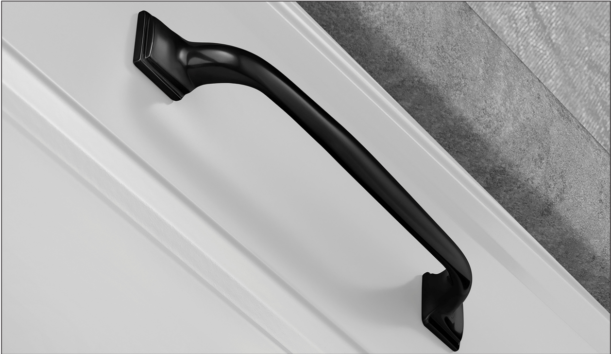
Matte Black (Finish ID : 19)