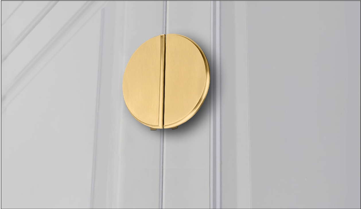
Satin Brass (Finish ID:13)