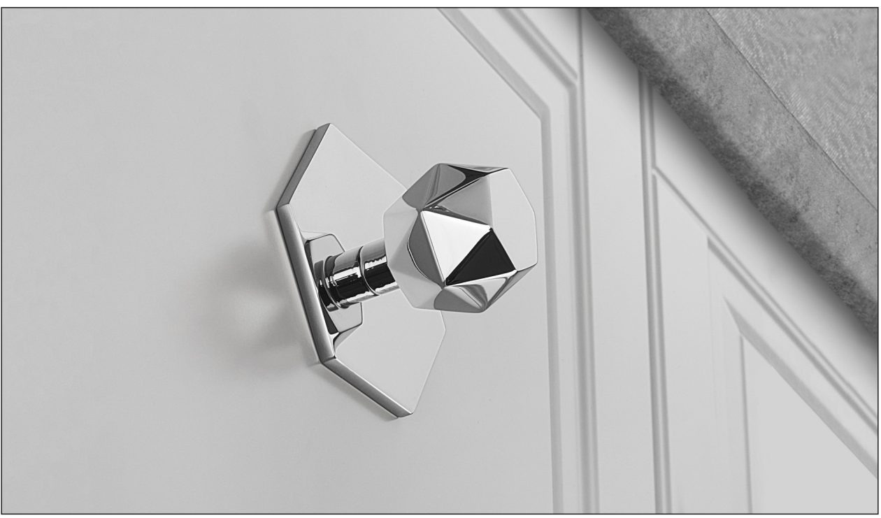
Bright Chrome (Finish ID:2)