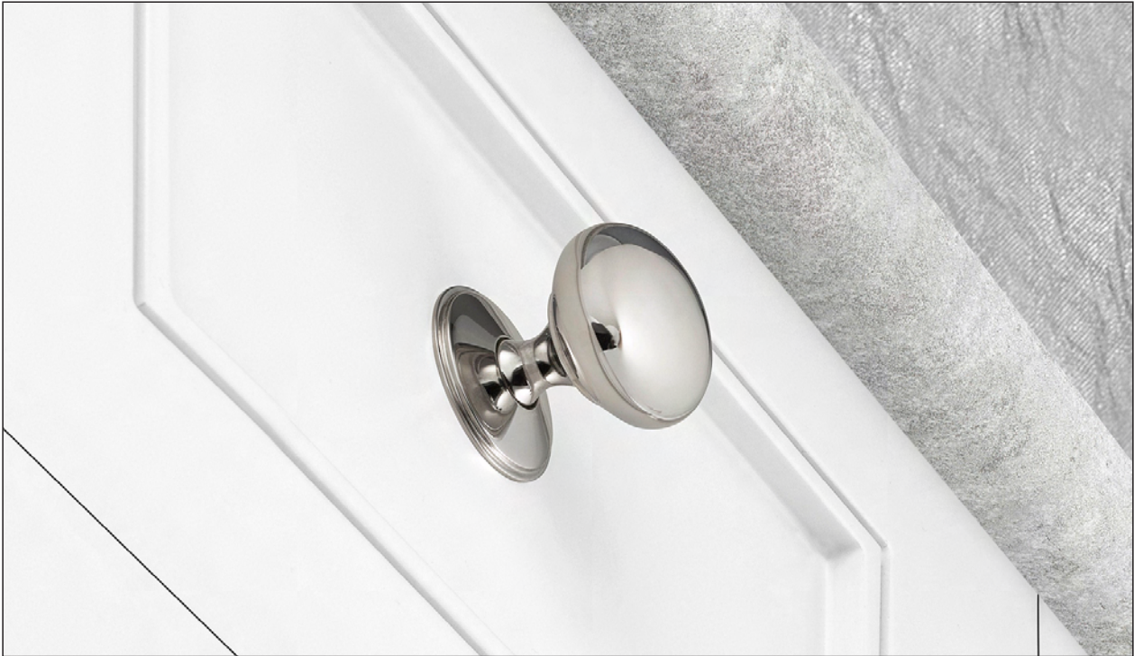
Bright Chrome (Finish ID : 2)