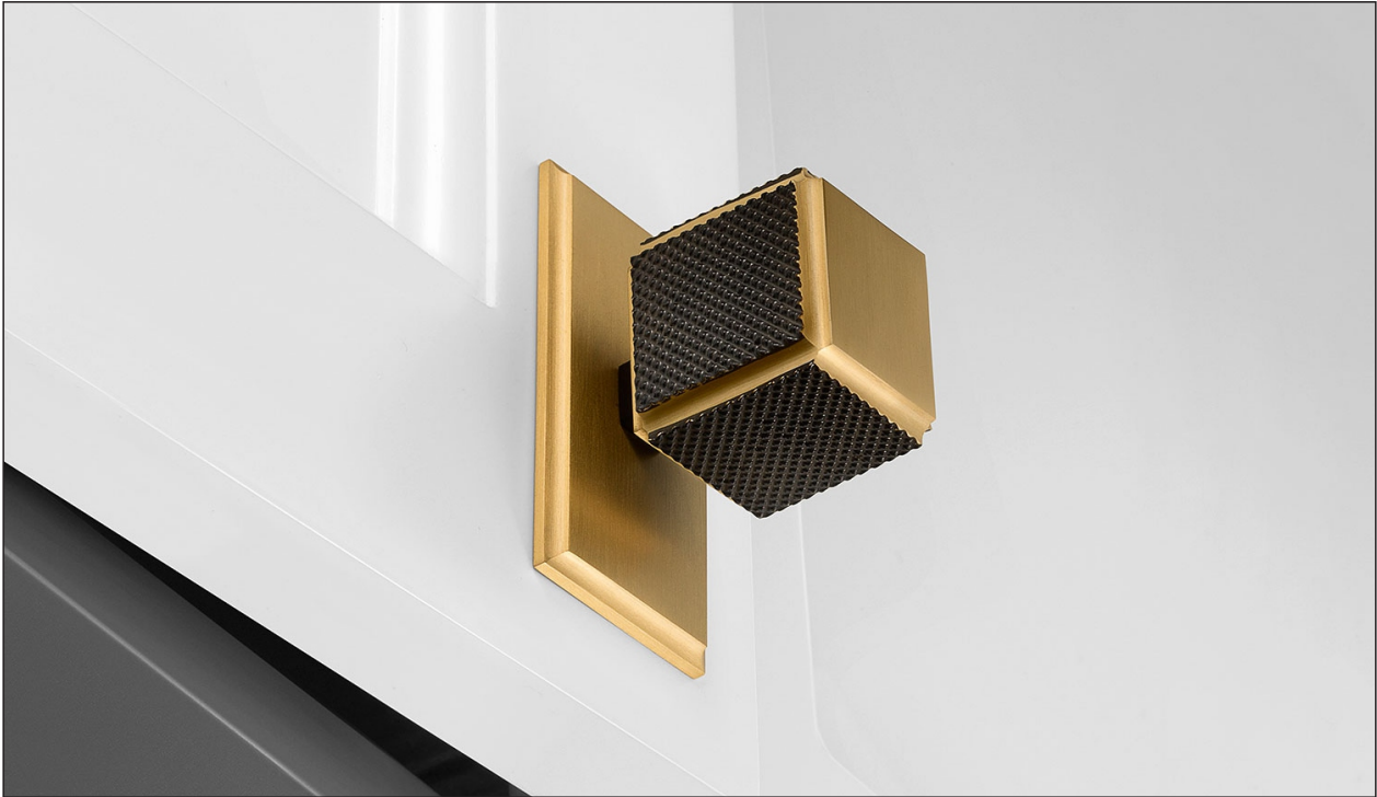
Split Black and Satin Brass with Satin Brass Back Plate (Finish ID:49A)