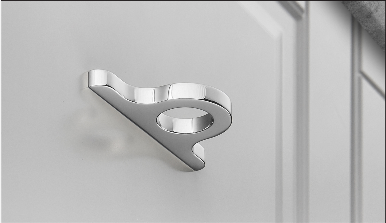
Bright Chrome (Finish ID:2)