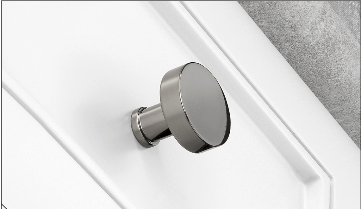
Titanium (Finish ID:79)