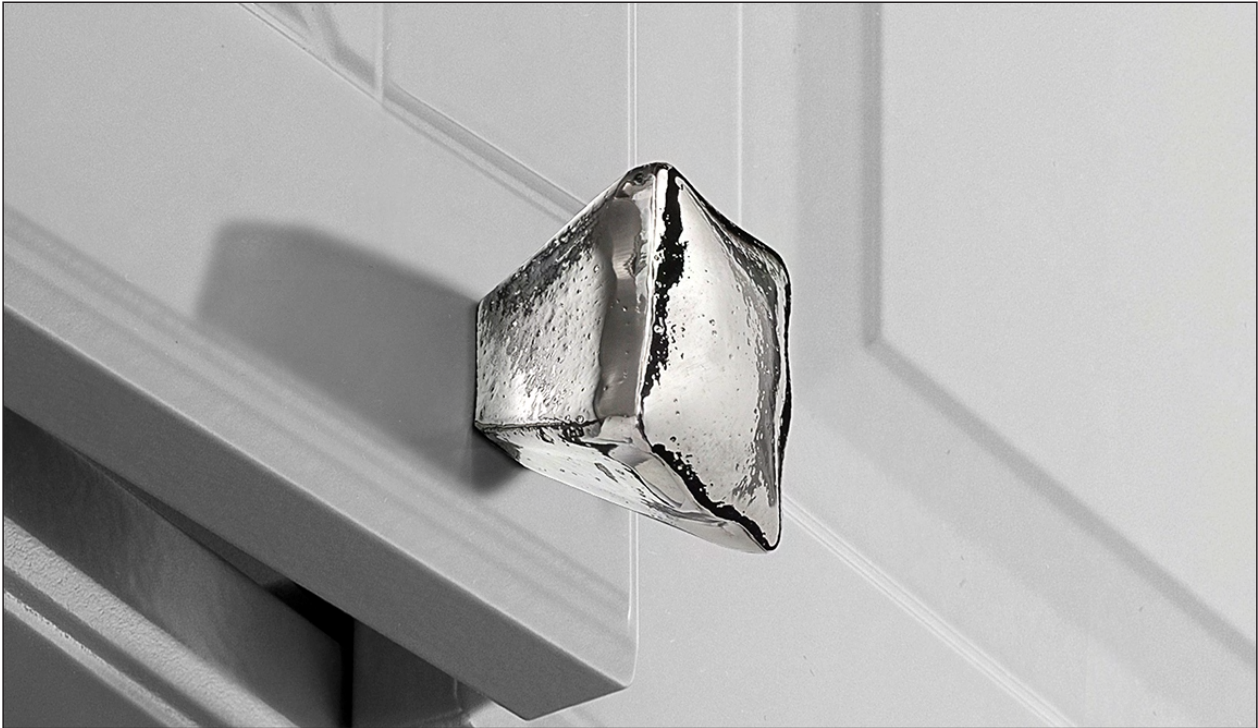
Polished Nickel (Finish ID : 8)