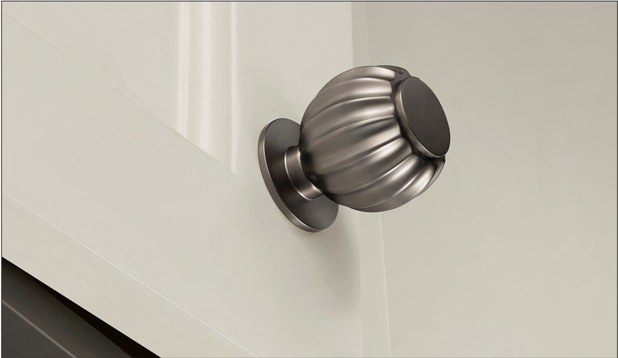
Graphite (Finish ID : 61)