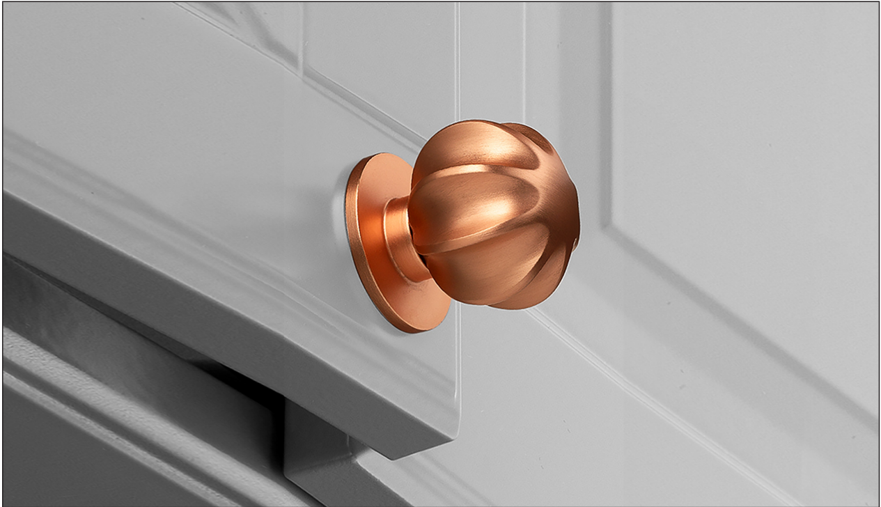
Satin Copper (Finish ID : 58)