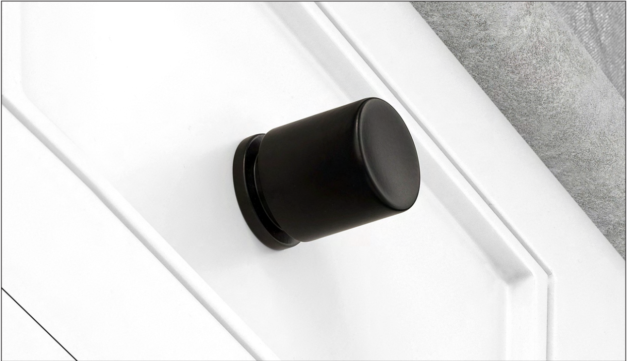
Matte Black (Finish ID : 19)