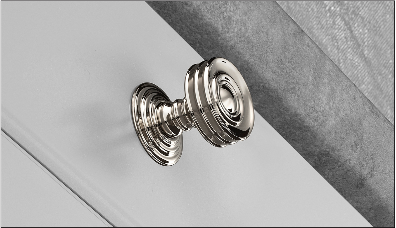
Polished Nickel (Finish ID : 8)