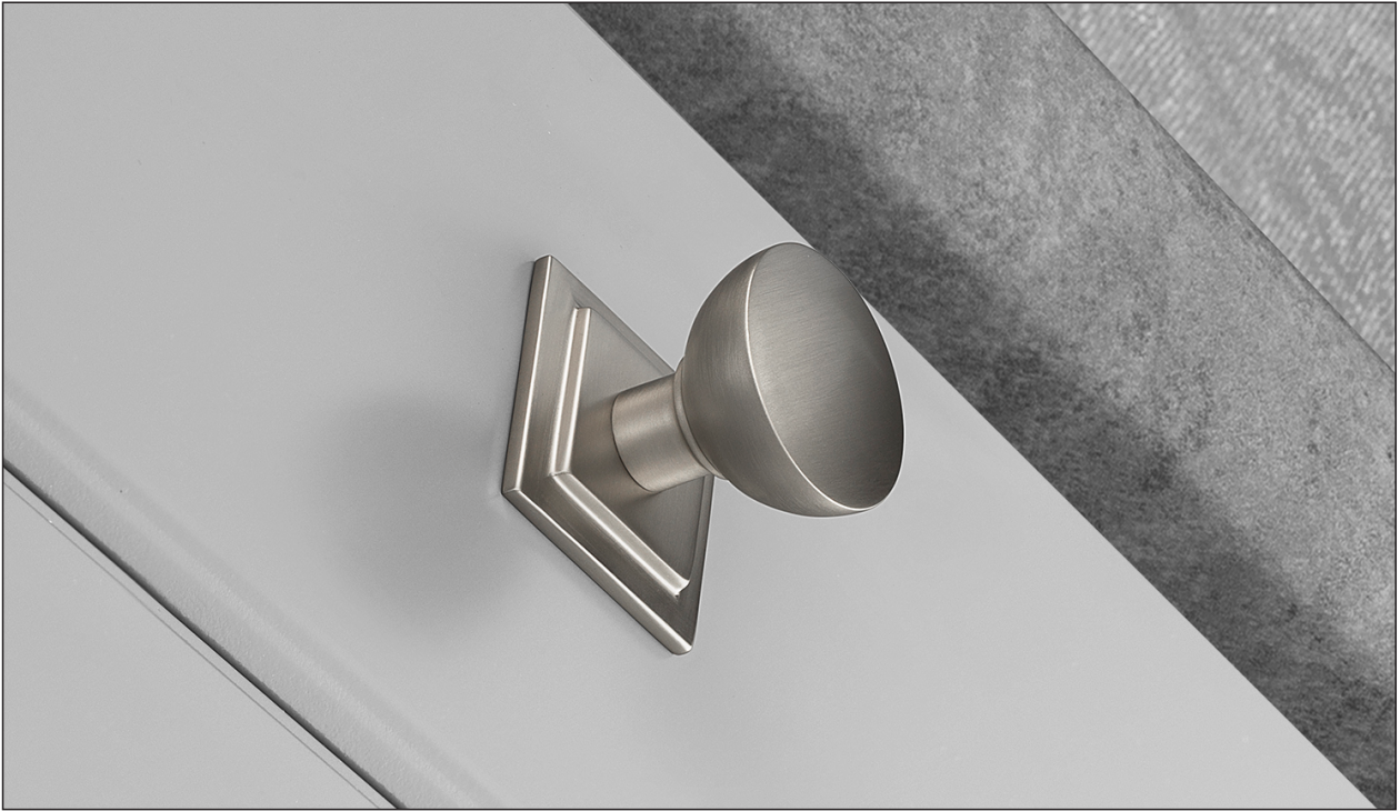
Brush Nickel (Finish ID : 3)