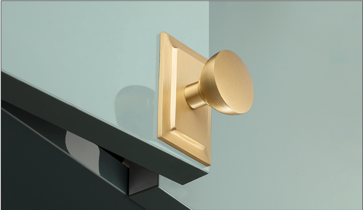
Satin Brass (Finish ID : 13)