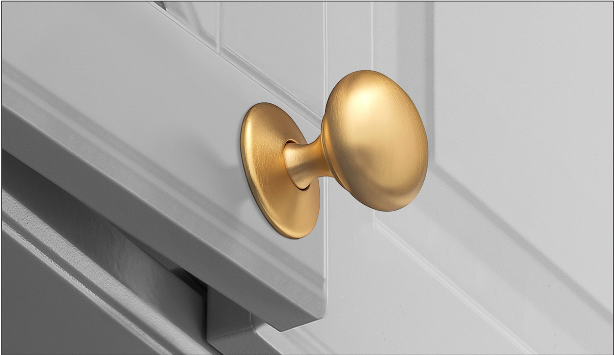
Satin Brass (Finish ID:13)