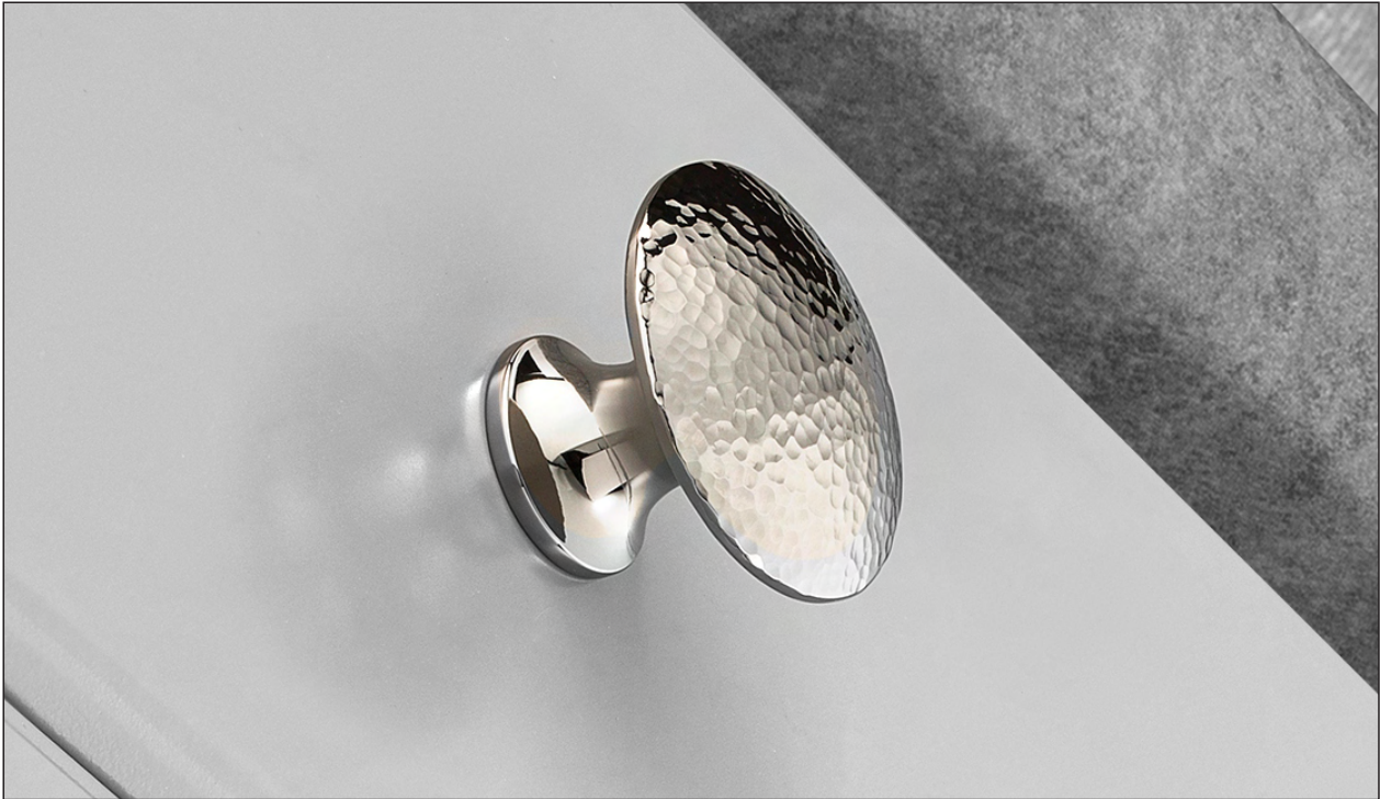
Hammered over Polished Nickel (Finish ID:12-8)