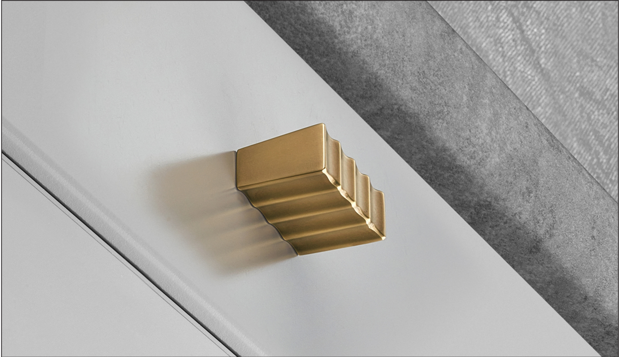
Aged Brass (Finish ID:4)