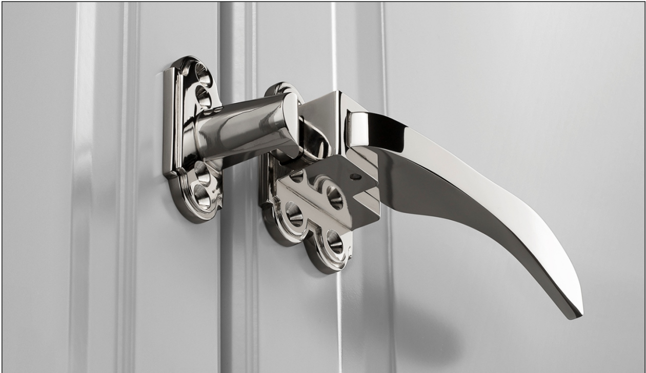
Polished Nickel (Finish ID : 8)