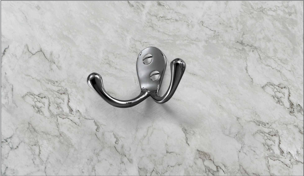
Polished Nickel (Finish ID:8)