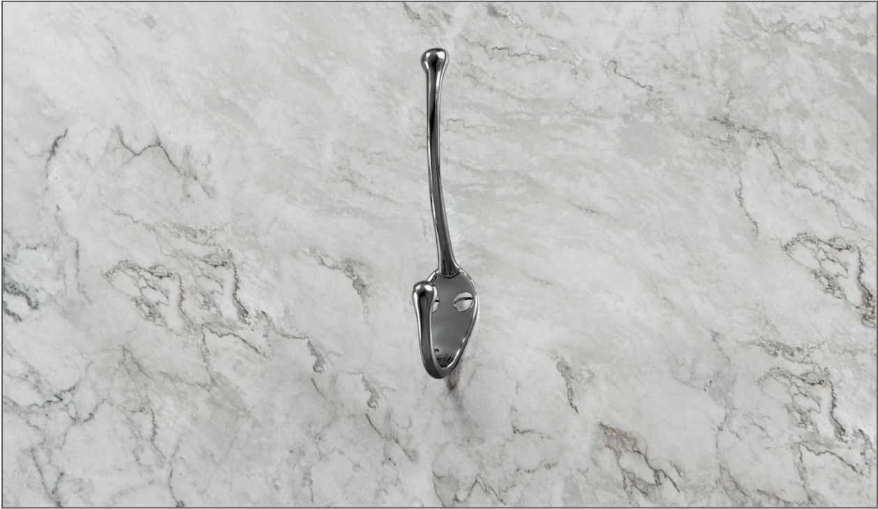
Polished Nickel (Finish ID:8)