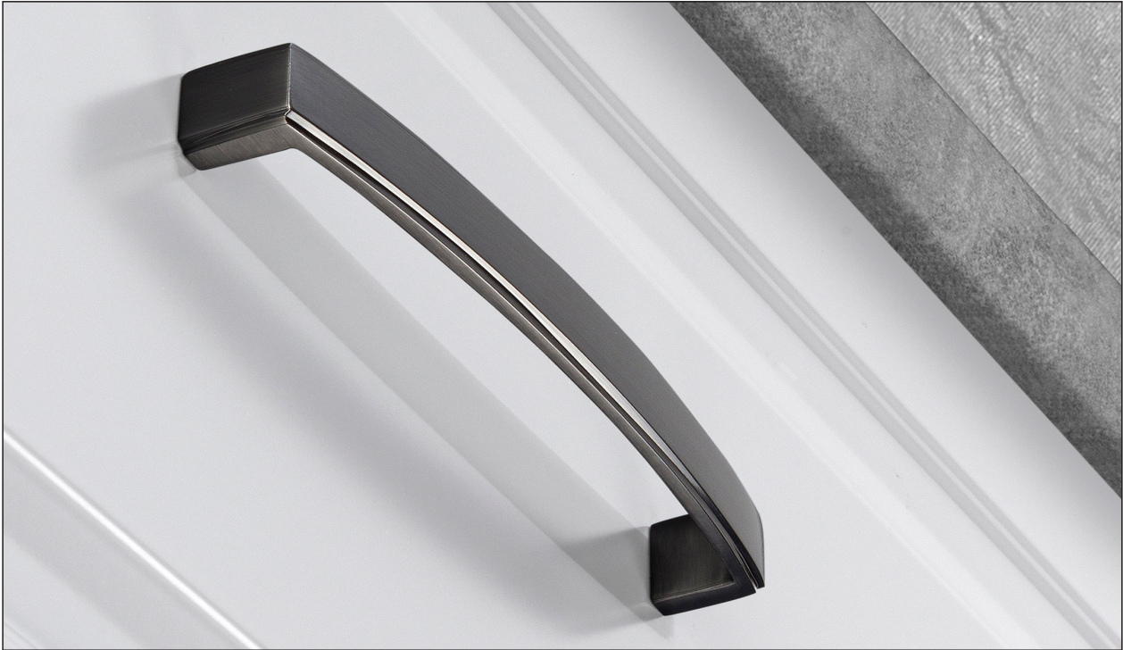
Graphite (Finish ID : 61)