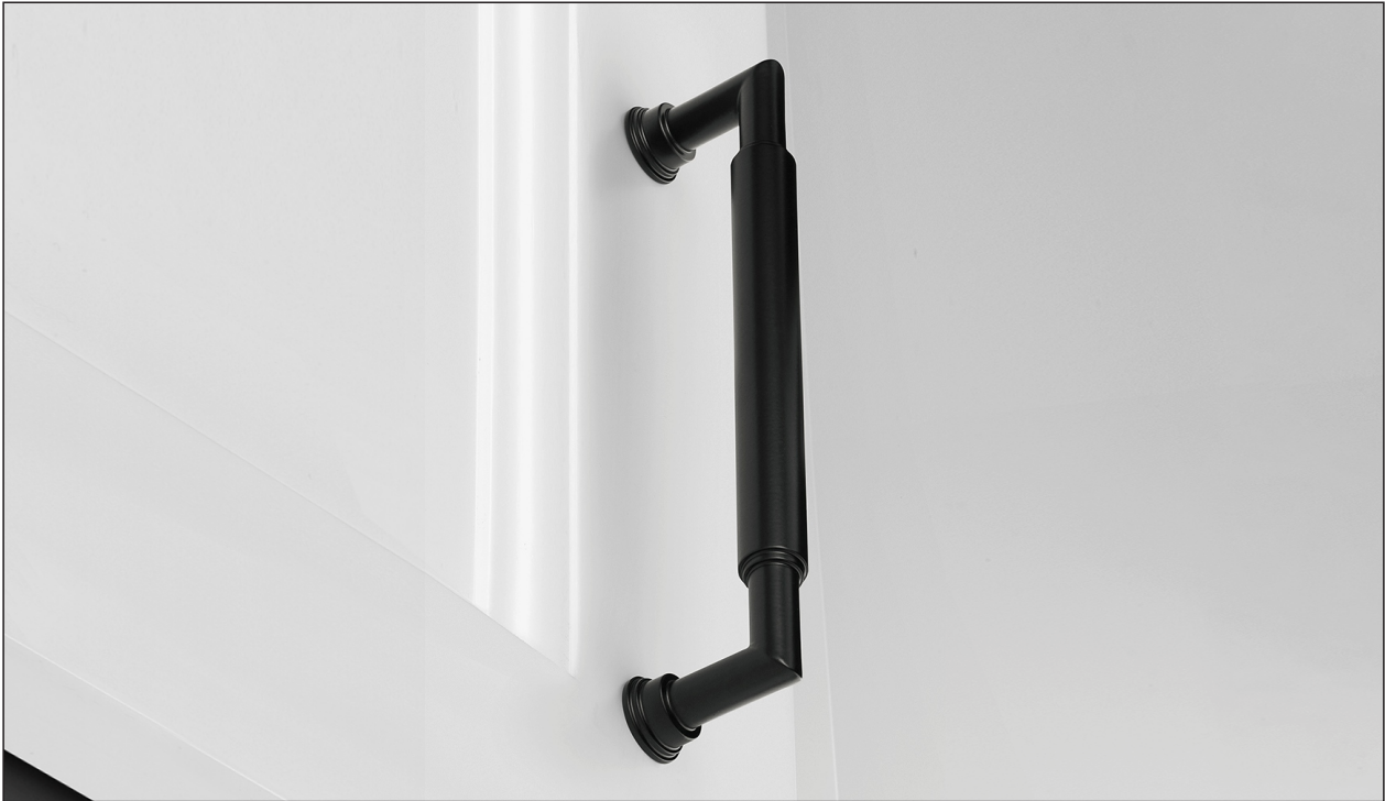
Matte Black (Finish ID:19)