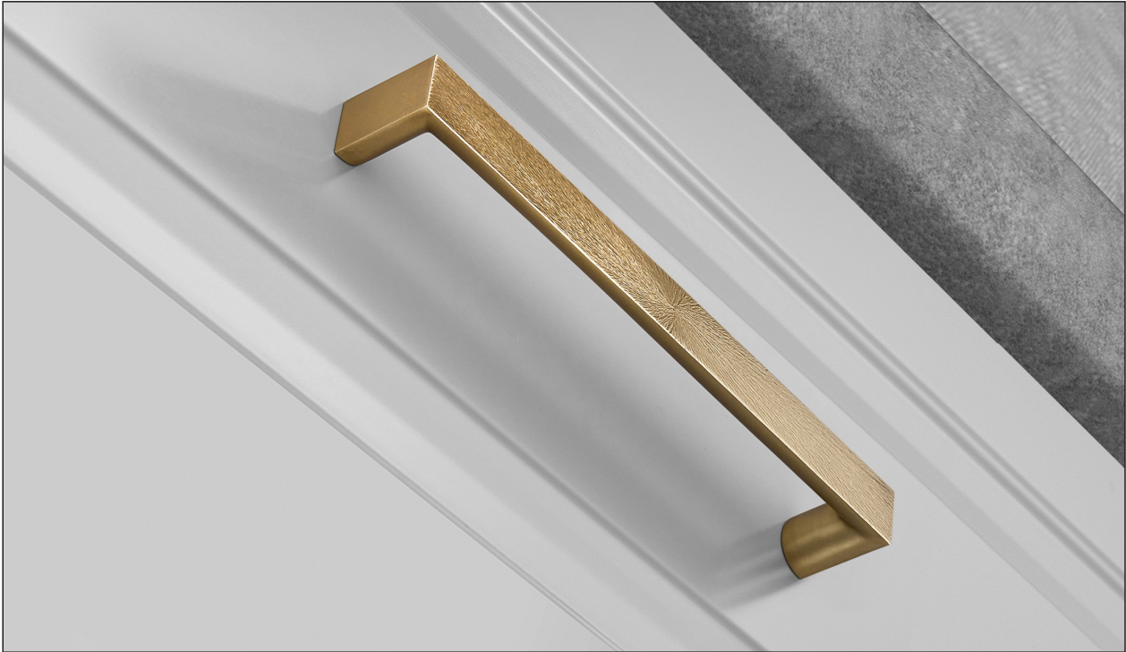
Aged Brass (Finish ID:4)