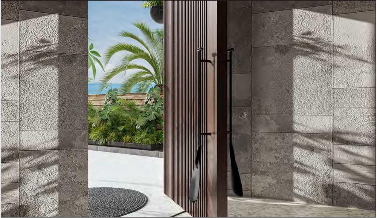
Matte Black (Finish ID:19)