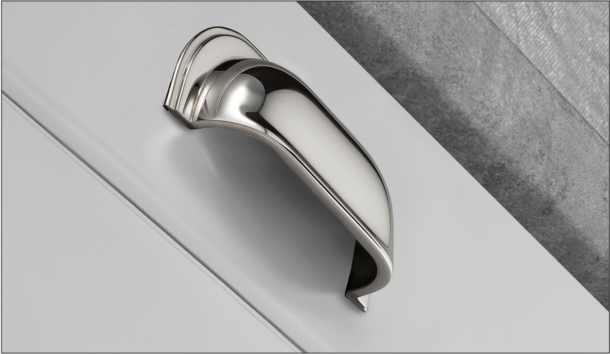
Polished Nickel (Finish ID : 8)