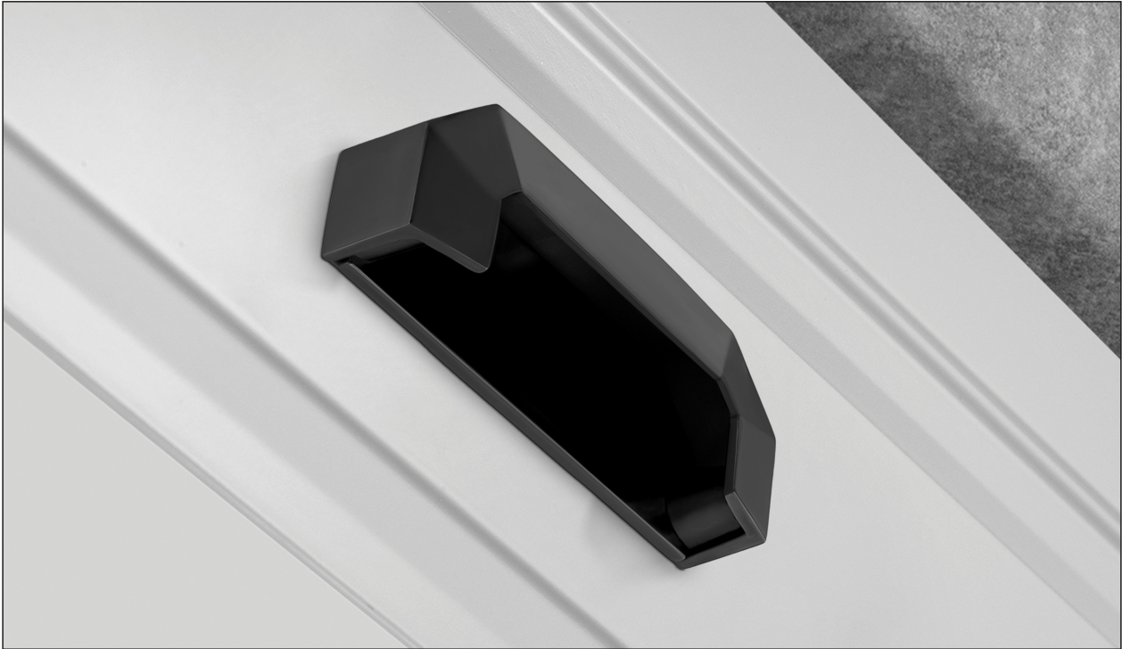
Matte Black (Finish ID:19)