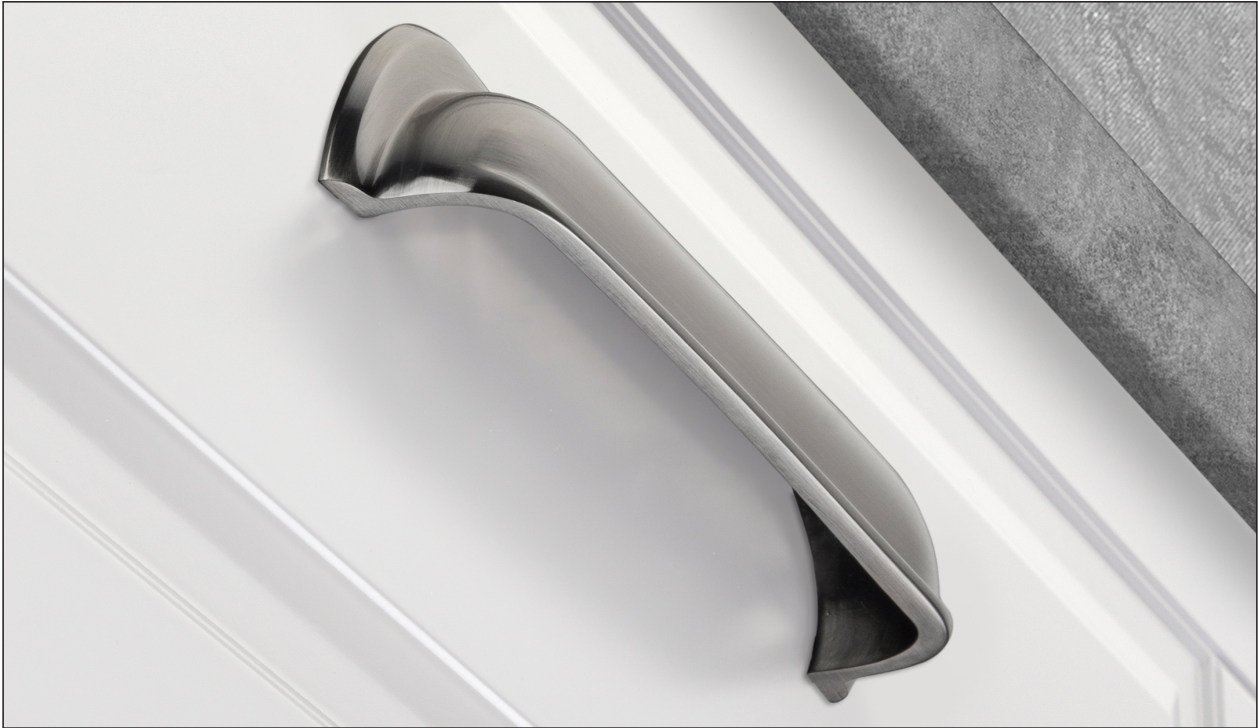
Brush Nickel (Finish ID : 3)