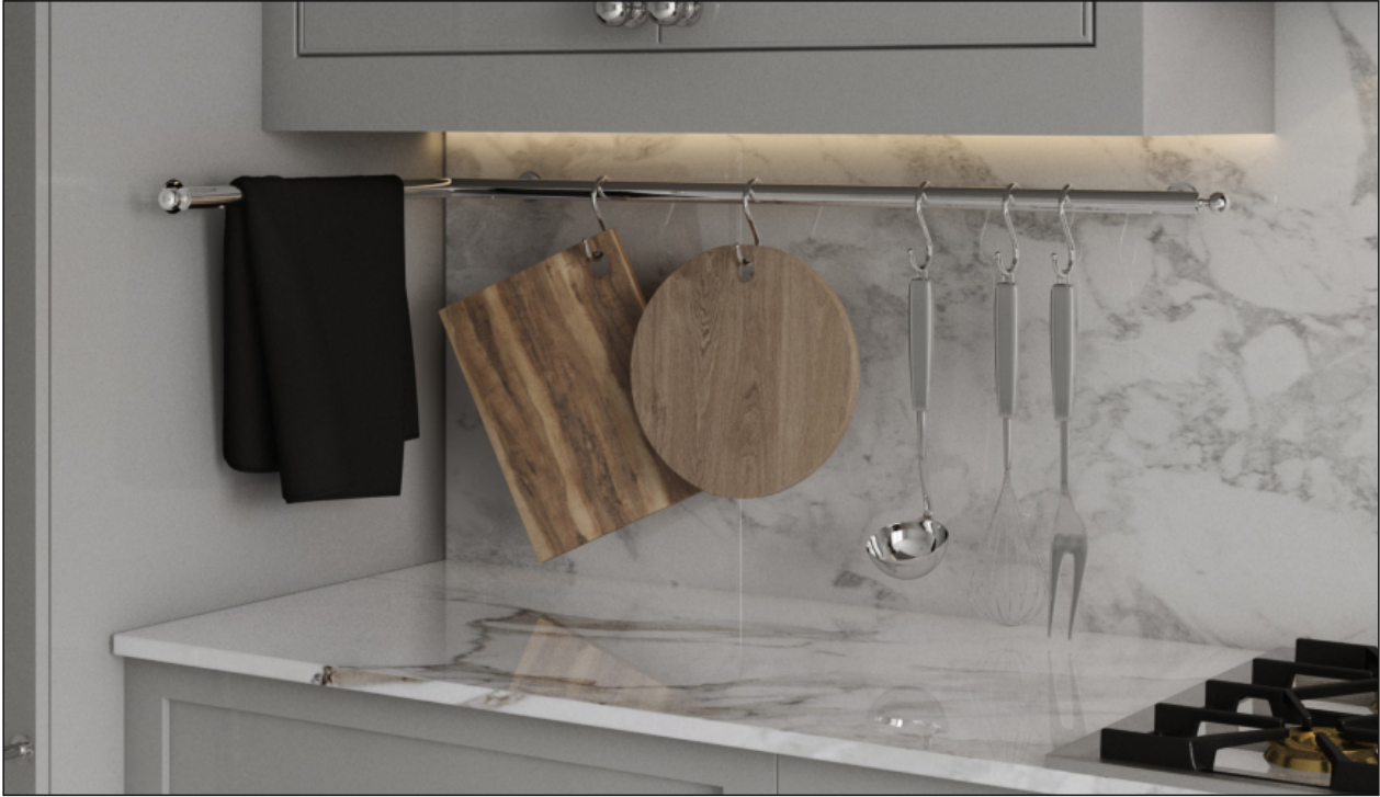
Polished Nickel (Finish ID:8)