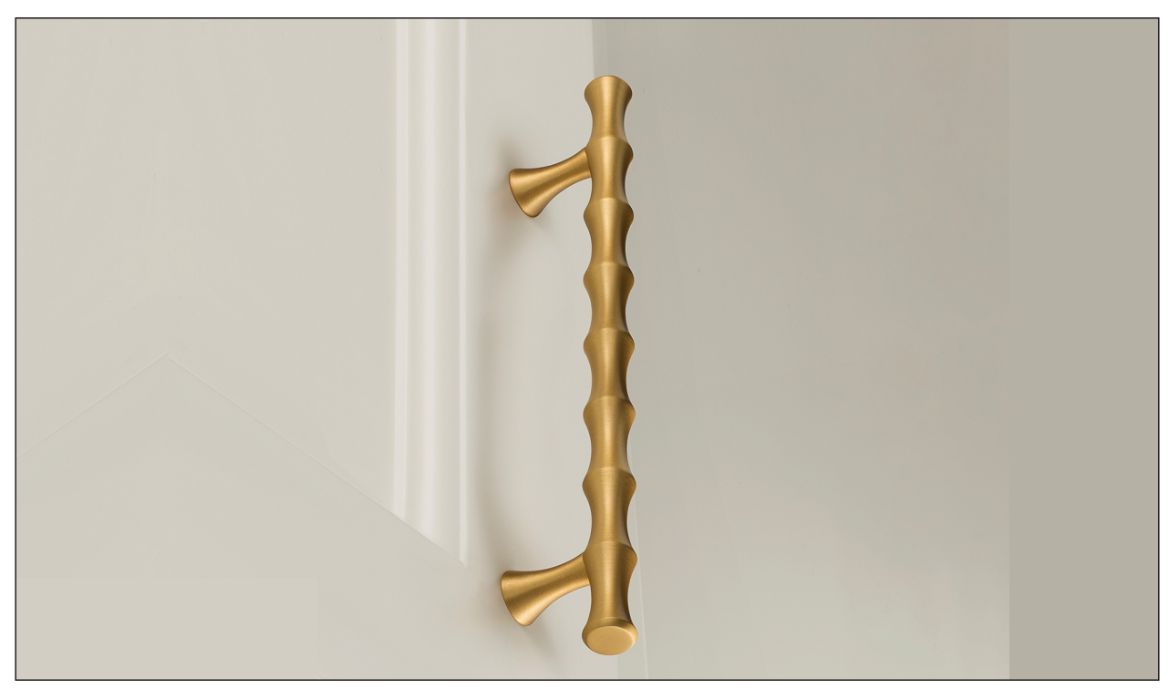
Satin Brass (Finish ID: 13)