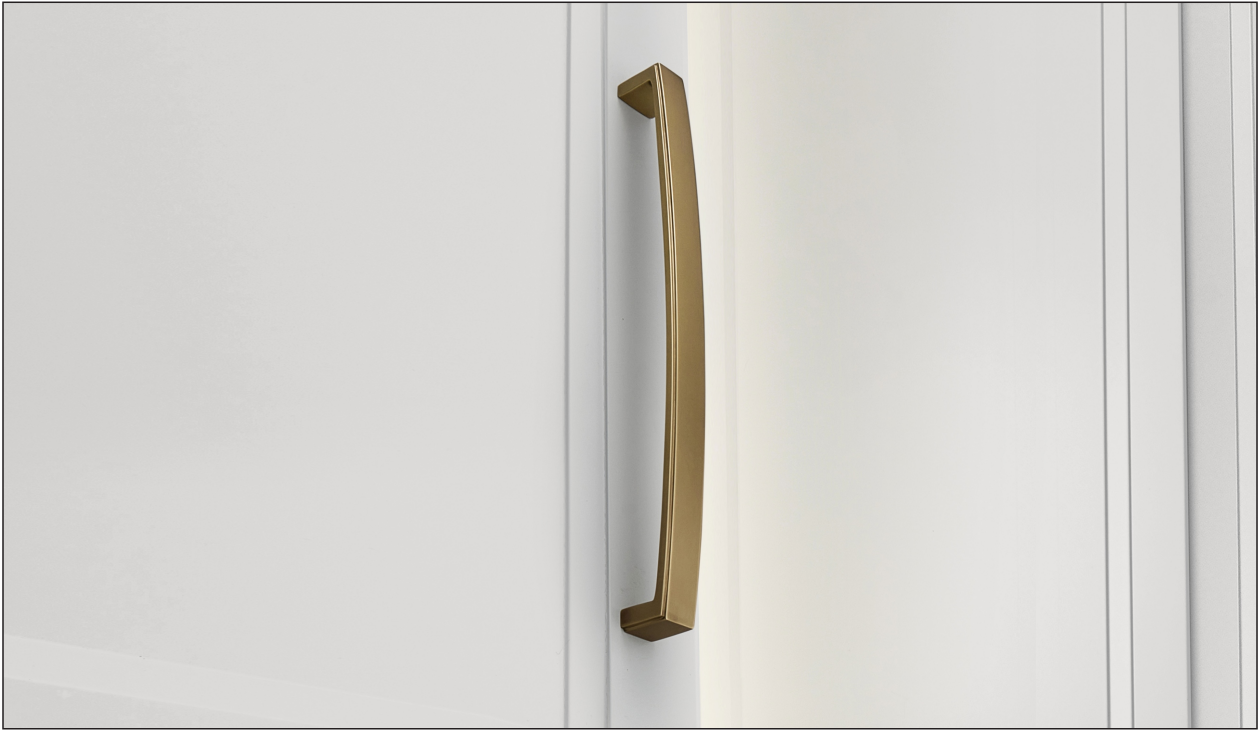
Aged Brass (Finish ID:4)