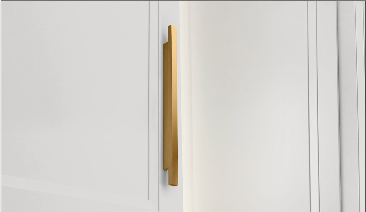
Satin Brass (Finish ID:13)