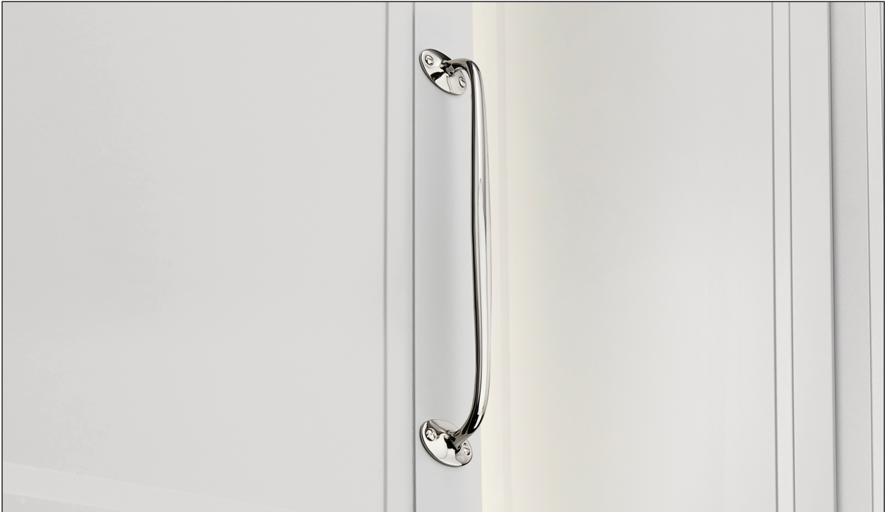
Polished Nickel (Finish ID:8)