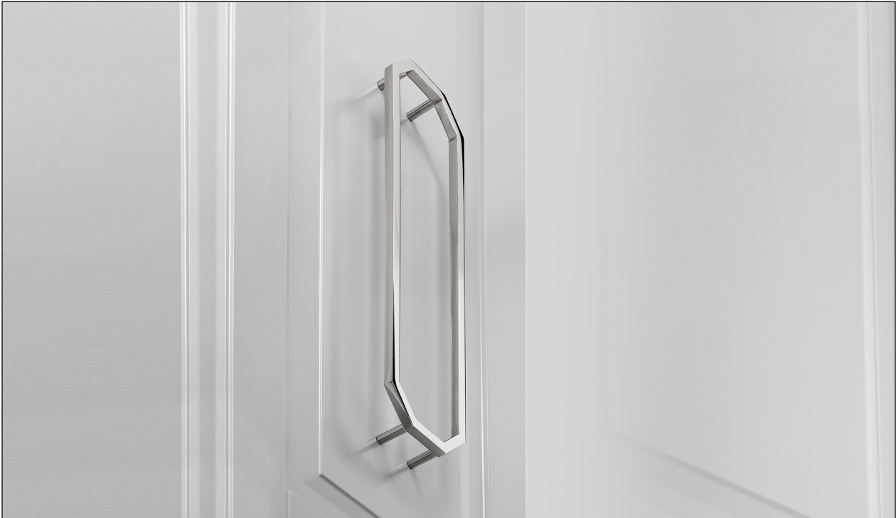
Polished Nickel (Finish ID:8)