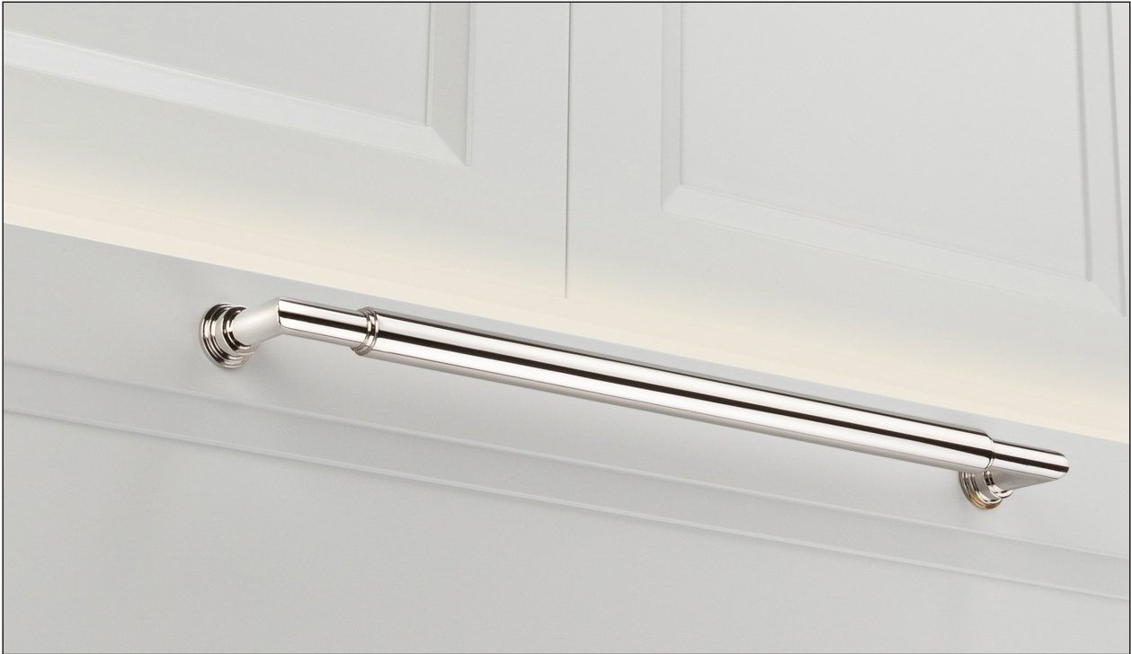
Polished Nickel (Finish ID:8)