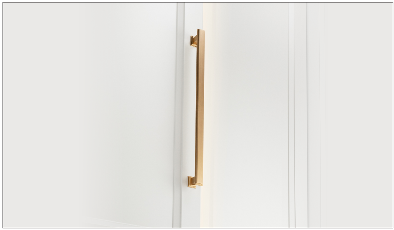
Satin Brass (Finish ID:13)