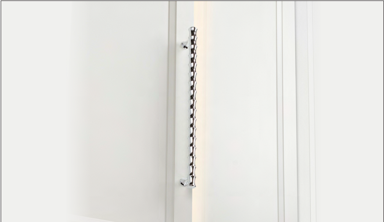
Polished Nickel (Finish ID:8)