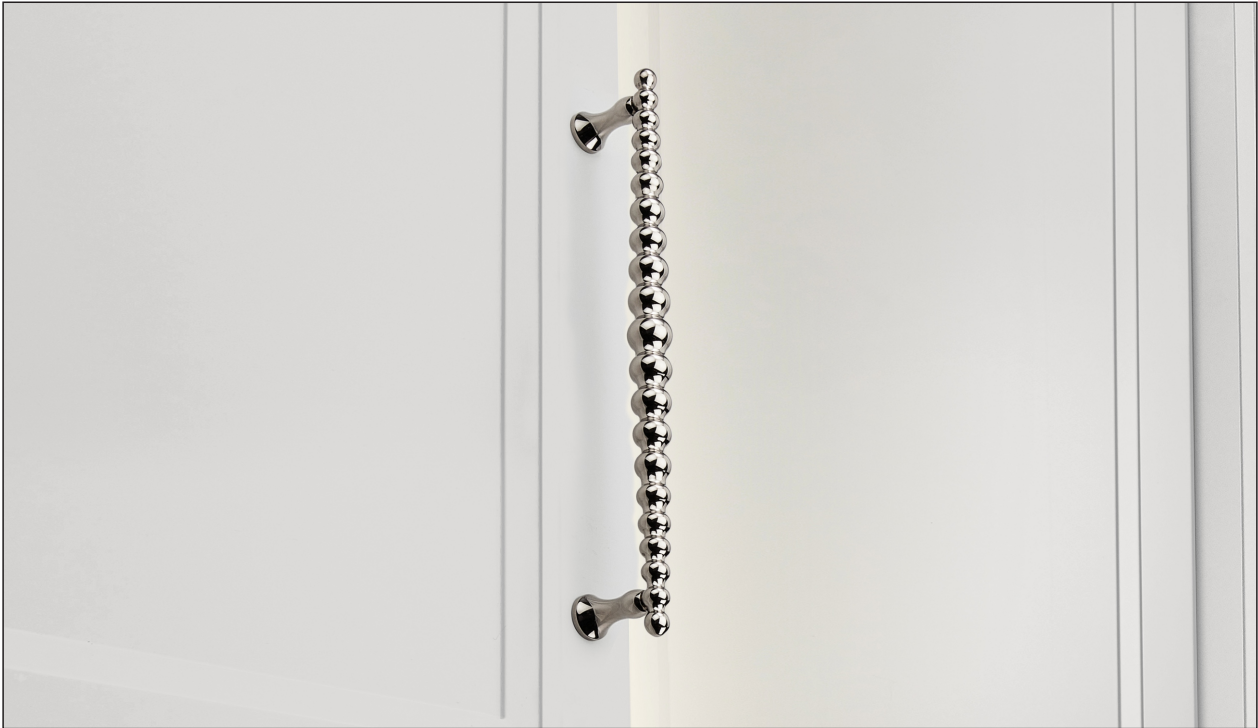
Polished Nickel (Finish ID : 8)