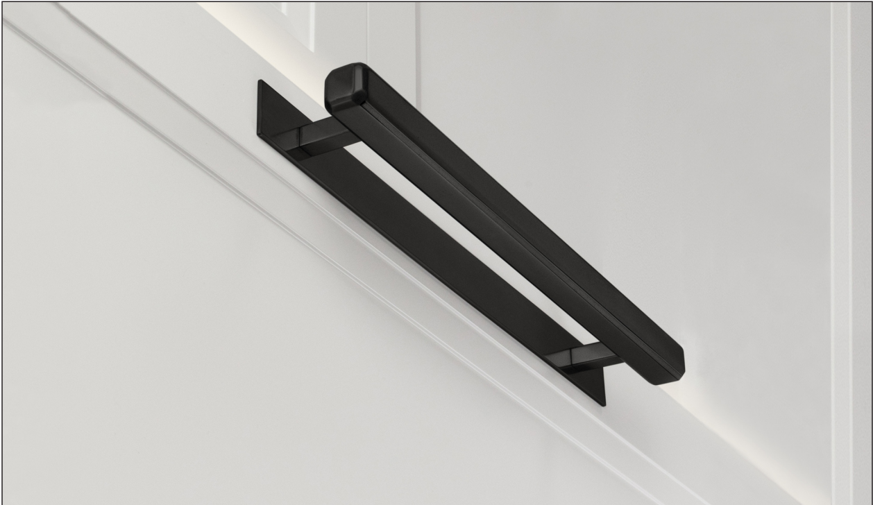
Matte Black (Finish ID:19)